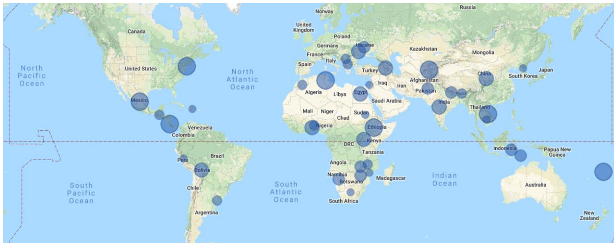
Figure 1 Map of UNPRPD Projects

Given the UNPRPD’s mandate towards strengthening inter-agency coordination and work on disability inclusion, funding support was provided to the development of the UN Disability Inclusion Strategy (UNDIS) to strengthen system-wide accessibility and mainstreaming of the rights of persons with disabilities. The UNPRPD Technical Secretariat participated in all meetings and consultations of the UN Inter-Agency Support Group to the CRPD’s Working Group on the development of the UNDIS.